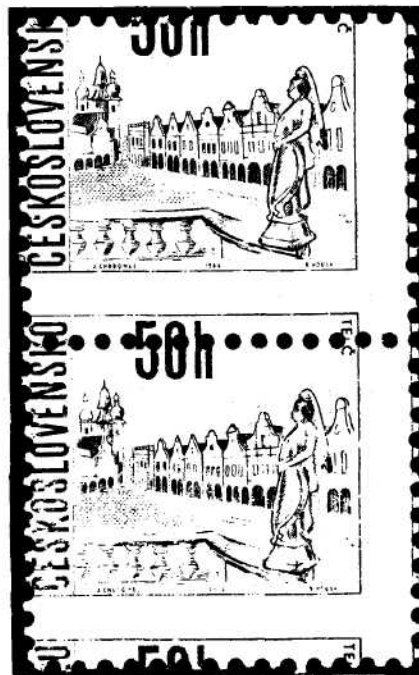
Figure 2. Color and Perforation Shift Discovered in Neratovice

Additional faults have been reported by V. Drazan 4 and include copies purchased in March, 1981 at the post office in Neratovice. The shift in the ocher color and shift in perforations are of such magnitude that the "stamps" may more accurately be referred to as "freaks". A vertical pair of such "freaks" is illustrated in Figure 2.