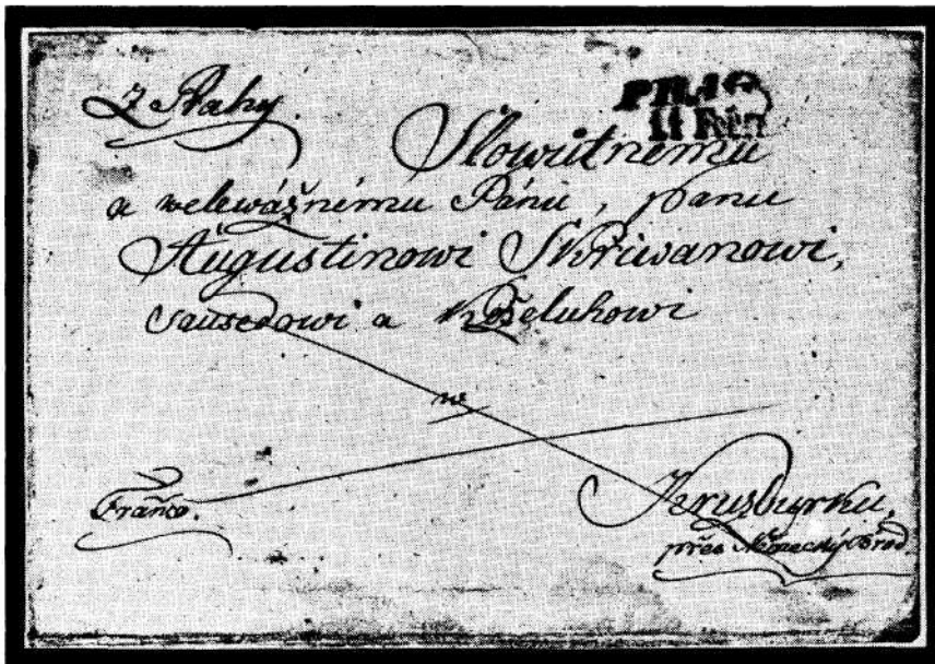
Fig 1. Cover from Prague, 11 February, (1845)

Prestamp covers originating in Bohemia during the period of the monarchy are often interesting and becoming increasingly scarcer as interest by postal historians continues to grow. The cover pictured below is interesting in that it involves correspondence between men of some note; men of "their time" who except for their correspondence might have been forgotten. More often, the only hint as to the correspondent's stature is a cover notation reading "EX OFFO", signifying "official" letters. But our letter tells much more - for we not only have the cover but the lovely letter as well.