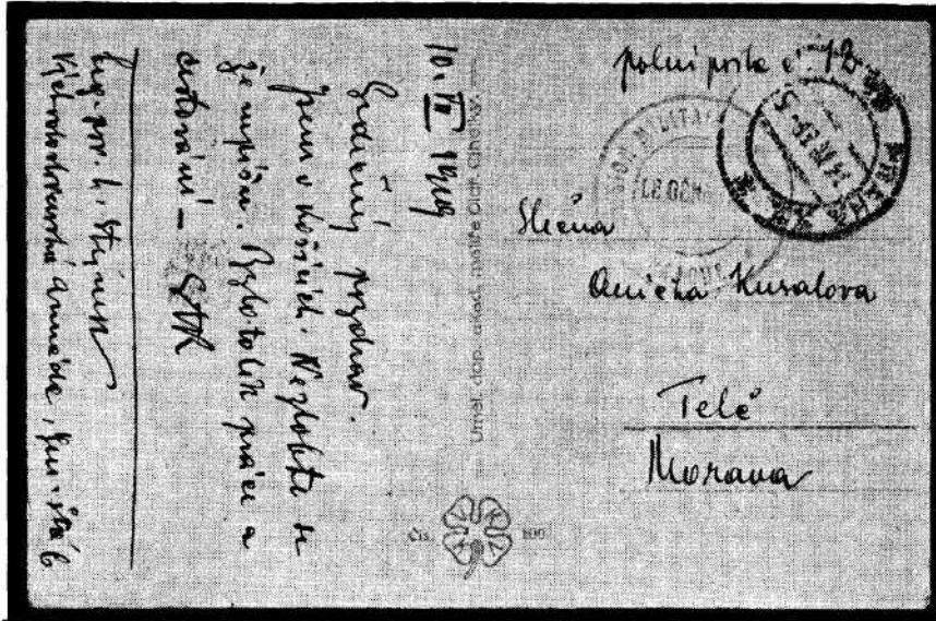
Fig. 35 - Field Post 12 via Prague, July 14, 1919

On July 19, 1919 the same officer again wrote from Košice, but listed Field Post 12 as his return address. The cover, (Fig. 35), is routed through the "Military Mission Headquarters of 'Le Général' (Hennocque) in Prague", and bears a regular Prague post mark (July 14th) besides the round unit marking in purple. It is interesting to note that the return address, listed earlier (in Fig. 34) as Headquarters of the Army of General Hennocque, is now listed as Headquarters of the Eastern Slovak Army.