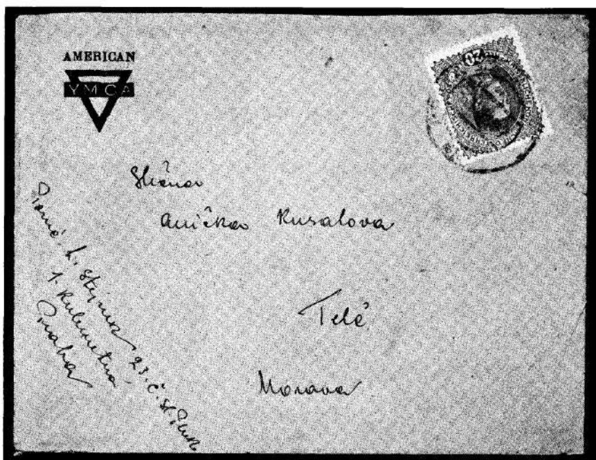
Fig. 32 - Prague, February 6, 1919, Austrian 20h "Karl" Used as Forerunner

On February 6, 1919 (Fig. 32), an officer of the 23rd Czechoslovak Regiment, 1st Machine Gun Company wrote to Teltsch from Prague, where there was no field post office. Hence he used regular mail, properly franked with the Austrian 20h "Karl", which remained valid through the end of February 1919. (Note American YMCA issue envelope.)