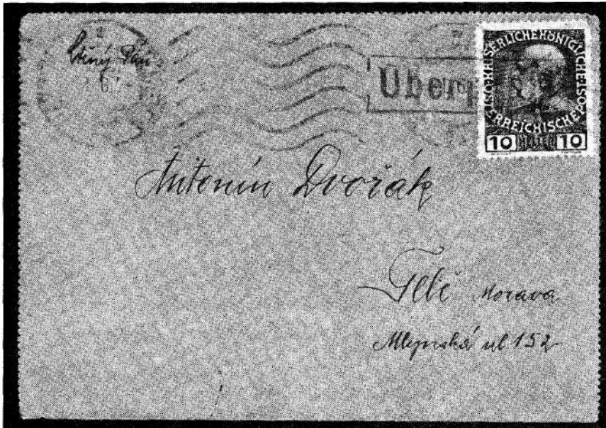
Fig. 31 - Military Censor Marking on Civilian Mail, Pilsen, 1916

While no civilian or military censorship markings were applied in Tetsch, mail arriving in Tetsch frequently bore such markings. A typical such marking, applied in Pilsen, is shown in Fig. 31.