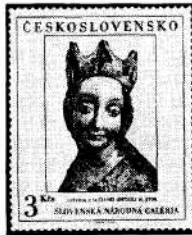
3 Kčs - Saint from Lučivno (detail) 14th century - Slovak National Gallery Engraved by Ladislav Jirka Colors: black-brown, brown, grey-green