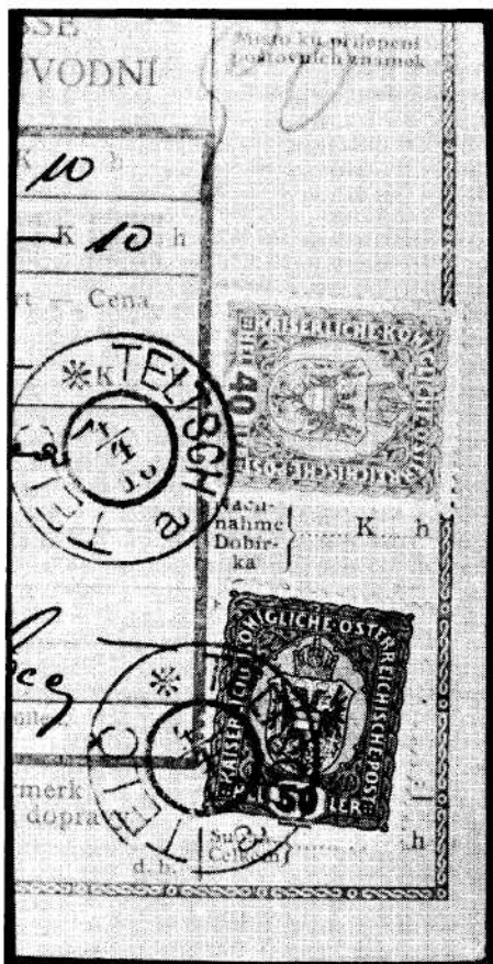
Fig. 26 - Second Tetsch Double Circle Post Mark (1903)

This post mark was followed only a year later by a similar one, listed by Votoček as G.122, differing in that the letter “a” was substituted for one of the asterisks, as shown in Fig. 26.