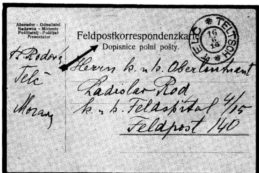
Fig. 29 - Field Post Card, Teltsch, June 16, 1916 to F.P. 140 (Field Hospital)

Since a large number of men from Teltsch served in the Austrian Army, field post correspondence to and from Teltsch is fairly common. Both departing and arriving field post mail was frank-free, whether or not "field post cards" were used. Departing and arriving field post mail are illustrated in Fig. 29 and 30. Field post cards leaving Teltsch were bilingual (see arrow), whereas arriving cards were generally not.