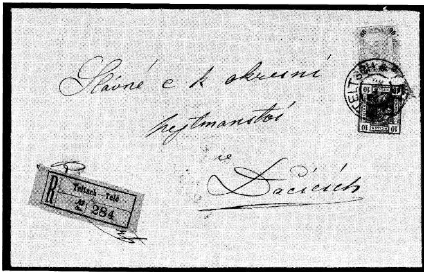
Fig. 25 - First Teltsch Double Circle Post Mark (1902)

Teltsch appeared content to enter the twentieth century with the single circle bilingual post mark in spite of the fact that a great many neighboring post offices had already adopted the double circle marking. The first double circle post mark appeared in 1902, and is listed in the Votoček reference as G. 121. It is shown in Fig. 25 on a registered cover post marked on January 28, 1905. The marking is bilingual, with the German and Czech name separated by asterisks.