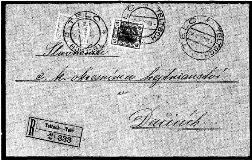
Fig. 27. - Third and Final Teltsch Double Circle Post Mark (1906)

The covers shown in Figures 25 and 27 also show a change in the bilingual registry label, from imperforate to perforated with clearer printing. This change probably occurred between December 1906 and June 1907.