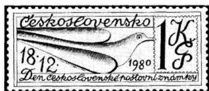
1 Kčs - Czechoslovak Stamp Day Engraved by Ladislav Jirko Colors: black, red, blue

The stamp as well as the cachet on the First Day Cover were designed by National Artist Karel Svolinský. It was printed by rotary recess print combined with two-color photogravure in sheets of 50 at the Post Printing Office in Prague. The dimensions of the stamp picture are 49 x 19 mm.