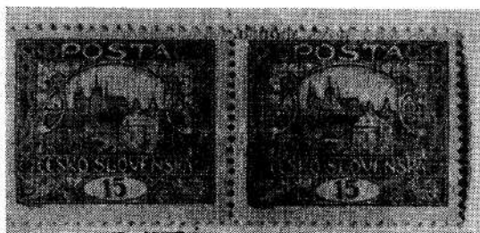
Type I Type II Joined types — Line 11\frac{1}{2} \times 13\frac{3}{4}

By Charles Chesloe, Box 237, Willow Springs, Ill. 60480