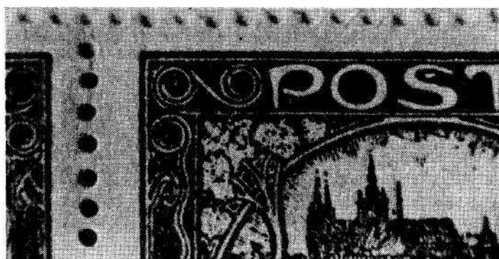
Type I — Open Spiral