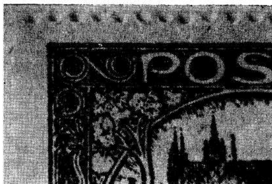
Type II — Closed Spiral