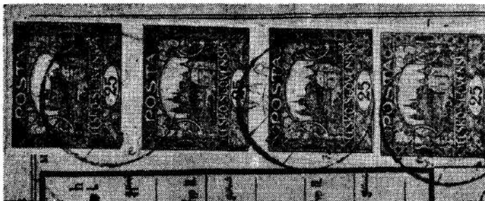
Parcel Post Clipping