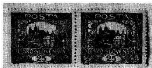
Type II Type I Comb 13\frac{3}{4} \times 13\frac{1}{2}

In the upper left corner the bottom curved line of the left spiral exists in two positions in relation to the common line joining both spirals. Type I the