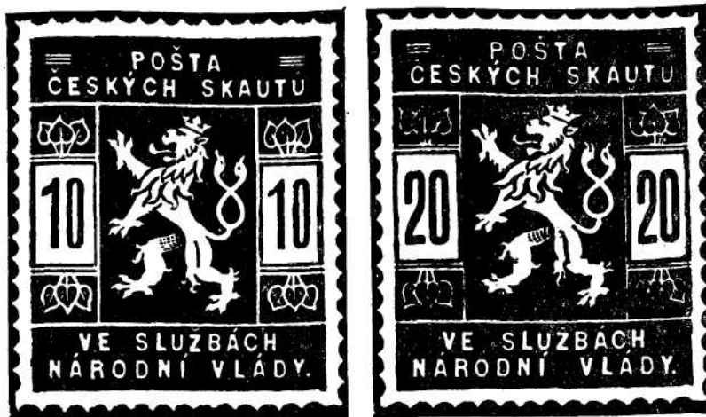
Figure 2. Genuine Scout stamps

Prof. A. B. Svojsik, who organized the first scout group in 1911, giving rise to scouting in Bohemia. The number of scouts and groups grew gradually until an independent organization (spolek) "Junak—Czech Scout" was organized June 15, 1914. The South Slav name "Junak," which the Czech Scouts called themselves, expressed their moral and physical qualities. Just as other scouts throughout the world, Czech Scouts used the lily blossom, on which they superimposed a drawing of a dog's head from the flag of the "dog-headers" (psihlavci). The dog-headers were ancient Czech guardians of the state borders and their dogs were considered a symbol of faithfulness and vigilance. Prof. A. B. Svojsik gave the scout movement a nationalistic coloration and began preparing the youth for the Czechs' forthcoming battle against the Austro-Hungarian monarchy. Therefore, the revolutionary events of 1918 found the Czech Scouts prepared and dedicated workers.