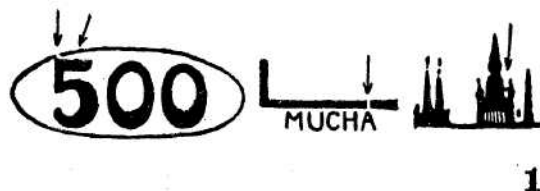
32nd Stamp Type I

Let's now describe some basic and secondary identification aids and features of Type I stamps from 32nd and 35th pane positions respectively. It must be noted that some of these features are more or less distinct and clearly outlined, but some others—in case of used stamps—could be obstructed in part or fully by cancellations. Also we shall not attempt to describe the identification aids and features of stamps of Type II, i.e., those of stamps from 22, 25, 31, 33, 34, 36, 42 and 46th pane positions because these features are insignificant and frequently undistinctive.