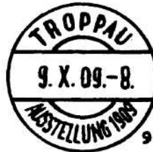
1909 TROPFAU - AUSSTELLUNG (9) 28.8-14.9 (Opava Fair)