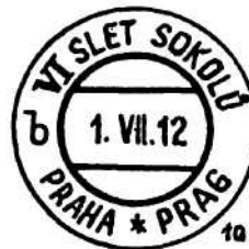
1912 VI. SLET SOKOLU - PRAHA - PRAG (10) 28.6-1.7. (VI Sokol Slet - Prague) a, b