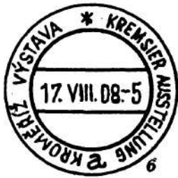
1908 KROMERIZ VYSTAVA - KREMSIER AUSSTELLUNG (6) 15.6 -15.9 (Kromeriz Fair)