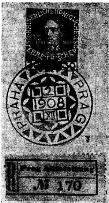
1908 Celebration of the 70th anniversary of the reign of Emperor Franz Joseph. The cancellation used in several cities has the same design and is red in color. (7)