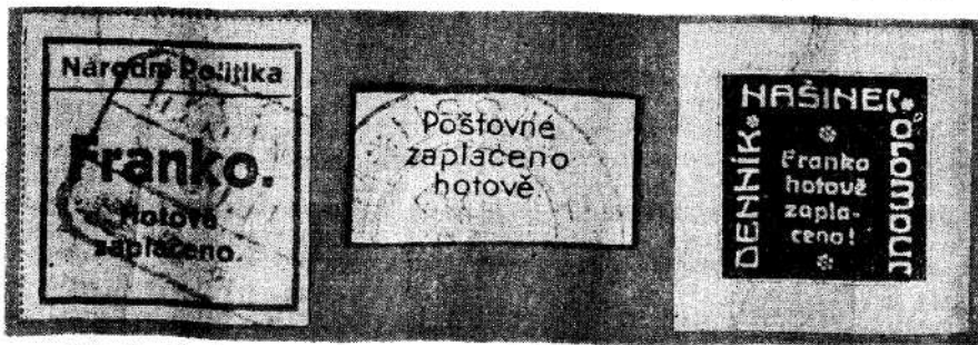
Fig. 2. Cash payment for postage indicated on newspaper labels.

On November 19, 1918, the Director General of Posts issued an order instituting cash payments for postage for newspapers and magazines. For this purpose all newspaper and magazine publishers were requested to re-