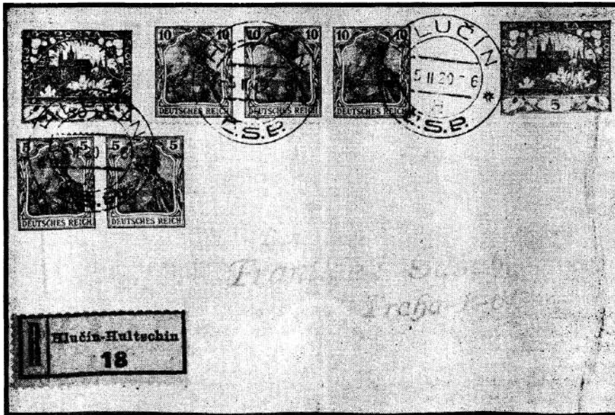
Fig. 5. Mixed franking with Czechoslovak and German stamps. Hlučín was taken over by Czechoslovakia on February 4, 1920.

It is of interest to note that the directive prohibiting the use of Austrian or Hungarian stamps after February 28, 1919, was not strictly enforced as mail matter is found franked with such stamps long after that date without any demand for postage dues. It must also be noted that cash payment for postage on first class mail and money orders was used long before the order of the Ministry permitting such a practice. Some postoffices were forced