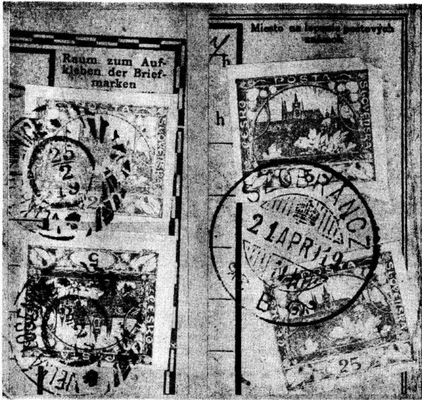
Fig. 1. Nationalized Postmarks. Left, postmark is Austrian in Czech with German name blocked out; right, postmark is Hungarian with changed date line.

The order permitting the use of such stamps throughout the country was an innovation, inasmuch as Austrian stamps became valid in Slovakia (former Hungary) and Hungarian stamps in the historic provinces, Bohemia, Moravia and Silesia (former Austria). However, only occasionally are Austrian stamps found to have been used in Slovakia and so far no Hungarian stamps have been found on mail matter in the historic provinces.