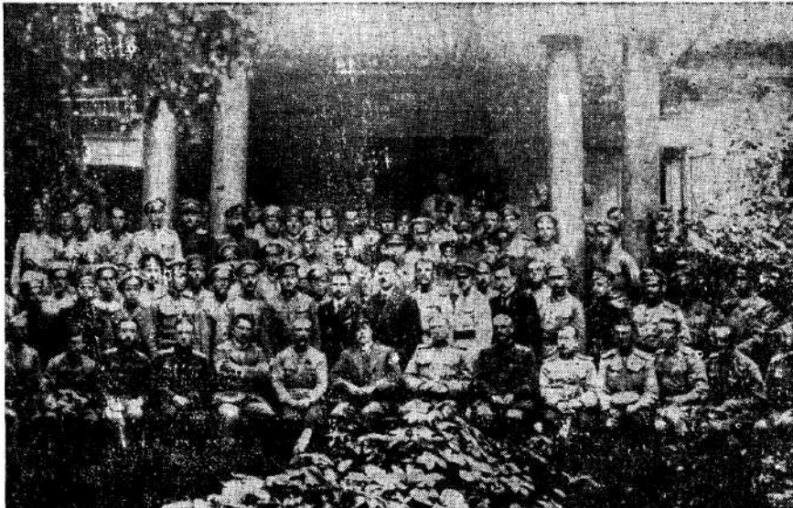
A meeting somewhere in Siberia between Thomas Garrigue Masaryk, who was commander-in-Chief of the Siberian Forces, center, front row, in civilian dress and wearing hat, and Gen. Ferdinand Foch, seen in the picture to Masaryk's left. The French General was on an inspection tour in Siberia. The others in the picture are officers and representatives of the other Allied armies in Siberia.