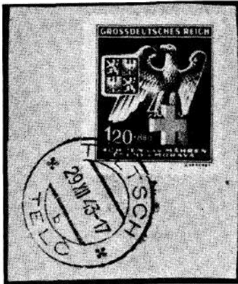
Fig. 42 - Bilingual Post Mark Introduced After First Year of Occupation