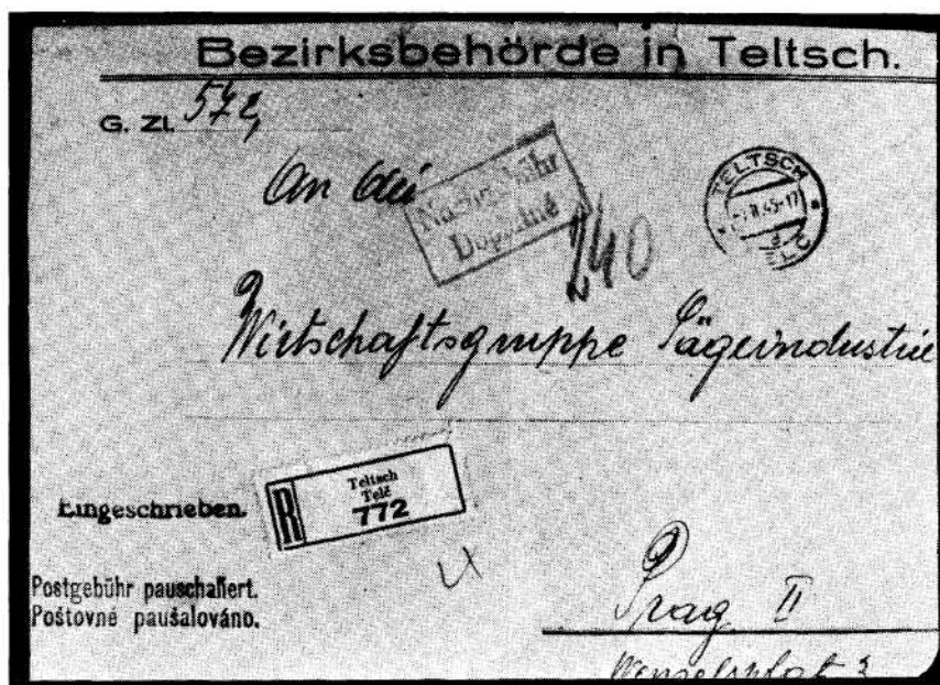
Fig. 44 - Registered Letter, Bulk Prepaid with Postage Due, Feb. 1, 1945