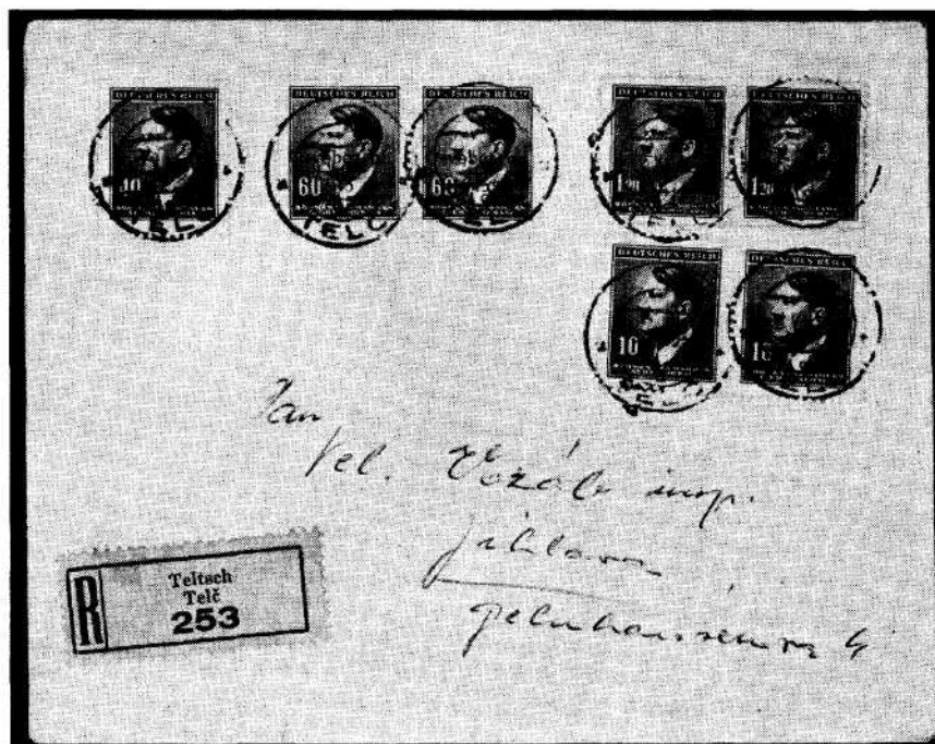
Fig. 47 - Locally Overprinted Usage Day of Liberation (May 9, 1945) Note Altered Postmark