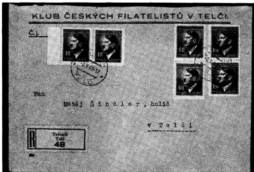
Fig. 46 - Locally Overprinted Usage Prior To Liberation (May 8, 1945)