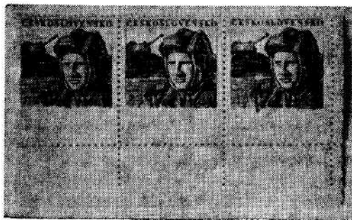
Fig. 2 — 3 Kčs partial printing variety

Figures 1 and 2 come from the issue of Czechoslovak "Army Day" on October 6, 1951. Figure 1 (Scott #483, Pofis #616) is an imperforate copy of the 1.00 Kčs showing an army field gunner and his gun; the usual perforation is listed in Pofis as 12½.