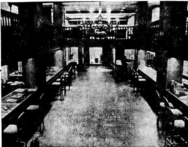
Interior view of two of our 4 floors at 3 East 57th Street